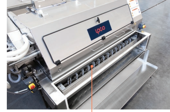
Spraying bar with nozzles.

The application of a release agent in the form of a spray ensures effective removal of pastilles from a steel belt. However, maximum efficiency and most economical use of materials depends on mixing a precise ratio of water and release agent. The IPCO ProMix system automates this process.