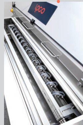
ProSpray release agent spraying system