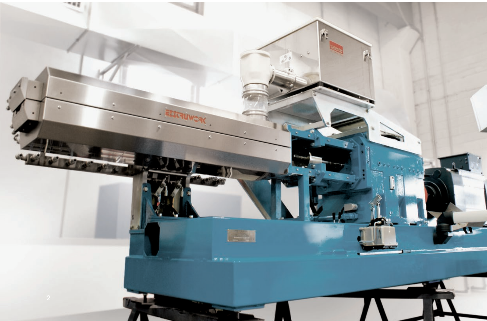
Twin screw extrusion machine.

As a major supplier of steel belt cooling systems since the early part of the 20th century, we have unparalleled experience in meeting the production, quality and environmental needs of customers from across the chemical and food industries.